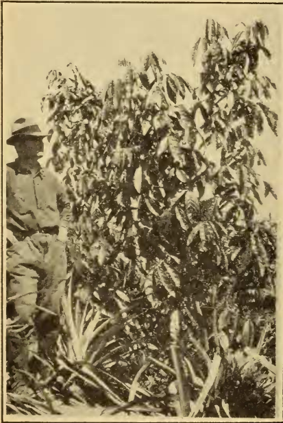
Fig. 2. Plants of Lonchocarpus nicou .

PERU: Dept. Ayacucho: Kimpitiriki, 8 Río Apurímac, 400 meters, nos. 22913, 23053. Dept. Junín: Near La Merced, 1300 meters, no. 23878; Santa Rosa, on Pichis Trail, 650 meters, no. 26200; Puerto Yessup, 400 meters, no. 26369; Puerto Bermudez, 375 meters, nos. 26490, 26597, 26612; El Trionfo, on Río Pichis, 350 meters, no. 26692; Cahuapanas, on Río Pichis, 340 meters, no. 26712. Dept. Loreto: Puerto Leguia, 290 meters, no. 27504; Masisea, 275 meters, no. 26837; Iquitos, 100 meters, nos. 26886, 26893, 26895, 26945, 27096, 27135, 27159, 27278, 27362, 27369, 27380, 27487; Mishuyacu, near Iquitos, nos. 29917, 29957; Peña Blanca, on Río Itaya, near Iquitos, 110 meters, no. 29668; Yurimaguas, lower Río Huallaga, 135 meters, nos. 27565, 27566, 27994, 27997, 28211, 28812, 29061, 29066; Balsapuerto, 135-350 meters, nos. 28158, 28255, 28300, 28325 (wild), 28458, 28586 (wild), 28621 (wild); Lower Río Marañón, 150 meters nos. 29279, 29280; mouth of Río Santiago, Tessmann 4447 (in Berlin herbarium; fragment U. S. N. M.).